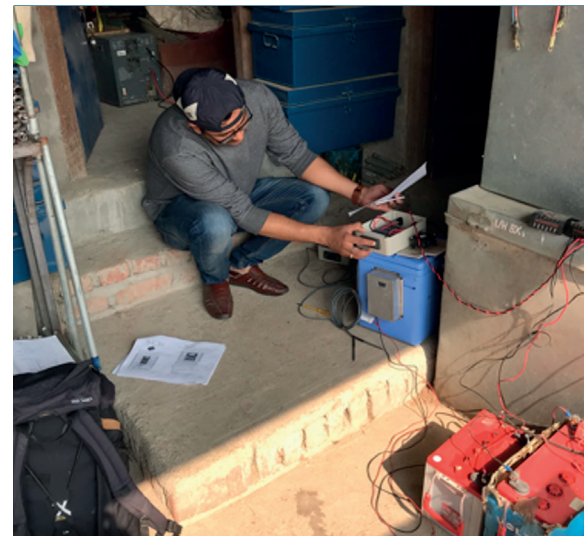
Figure 3: Locally constructed solar-powered incubators in Nepal