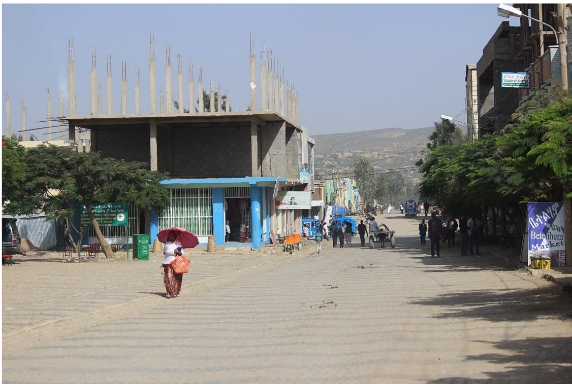
Fig. 1. The main road of Wukro.

people resorted to using different water sources. Water trucks were meant to be an official alternative water source, and some benefitted from regular water trucks (weekly), but most had never seen one in their area, despite water scarcity. The reselling or buying of water, though frequent practice, was illegal. People knew where to go to 'beg' for water at times of water interruption, but they were not informed (apart from a few respondents) when and if their tap water would flow, or whether the person will be willing to share their water. Many supplemented their water needs by borrowing or purchasing from neighbours, or informal water vendors, at costs ranging from 2 to 10 birr 5 [0.07–0.34 EUR] per 20-litre jerrycan, much higher than 5 birr [0.17 EUR] per 1000-litres through the piped network. Among water diary households 27 per cent of water expenditures accounted for water bought from neighbours or vendors. People were lacking entitlements (Mehta, 2014) to share water, access information or have control over water access. Despite these difficulties, the dynamics of the small town caused women to describe their water access in relation to others: those getting water once every-seven days would frequently note that, for them, it is manageable in comparison to others.