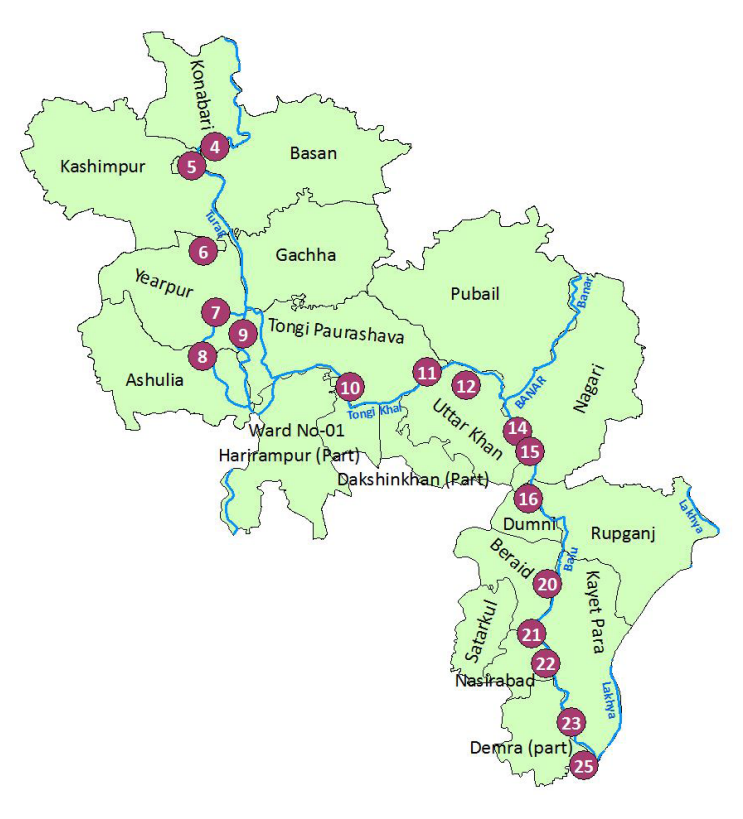
Figure 1: Location of sample sites

2. Water quality classification by Bangladesh national standards: water quality for the rivers around Dhaka is very poor, with low DO, high organic loading, and high levels of pathogens such as E. coli which greatly exceed national standards. Several water quality parameters tested at sample sites, shown in Figure 1, exceed national standards in every examined reach on average in the dry season, including COD, DO, ammonia, total coliforms, E. coli and suspend solids.