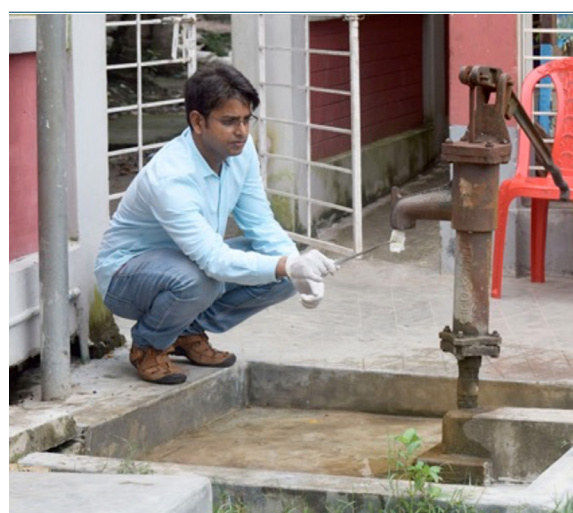
Figure 4: Water quality testing by the SafePani project