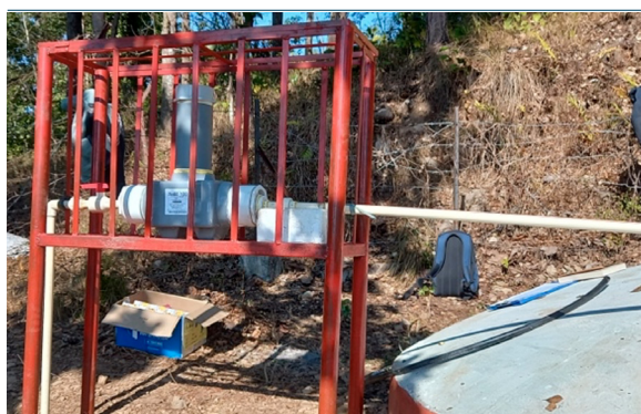
Figure 6: PureAll 100 device providing in-line chlorination for a piped supply in Karnali Province.

REACH collaborators are now advising SuSwa on the installation of passive chlorinators (Figure 6), including guidance on ongoing operational monitoring and control of the devices. These interactions have resulted in increased business for local chlorination vendors and led to discussions about future research opportunities on chlorination innovation. This example of replication of the REACH water safety approach in Nepal is further evidence of the growing demand for demonstrated water safety solutions for remote rural communities.