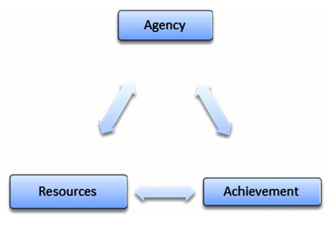
Figure 1 | Empowerment framework. Adapted from Kabeer (1999, p. 437).

The framework depicts empowerment as a dynamic process in developing individuals' capacity to articulate preferences and make decisions to fulfill their potentials or acquire resources. In her view, resources include both material resources (e.g., earnings and assets), human resources (e.g., education, training and skill development programs, and self-efficacy), and social support (e.g., participation in community groups, peer networks, and