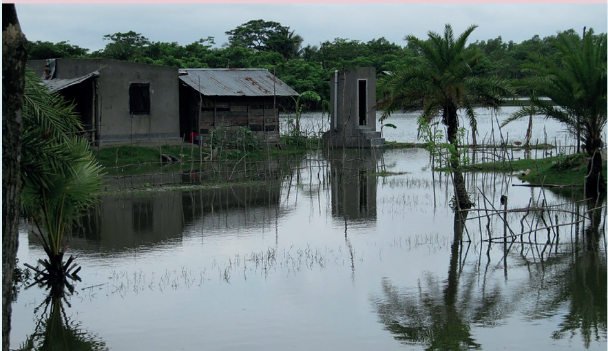
Figure 3: In Bangladesh, heavy rainfall, flooding events and warmer temperatures increase the risk of faecal contamination of drinking water supplies.

REACH has also worked on institutional models of rural water supply management in Kenya with FundiFix to improve reliability of services.