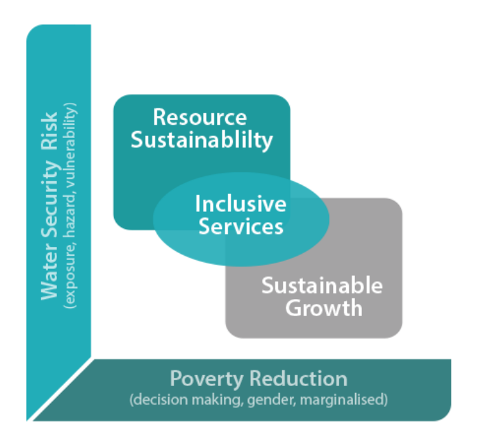
Figure 1 REACH conceptual understanding of Water Security Risk and Poverty Reduction

Resource sustainability, inclusive services and sustainable growth are not mutually exclusive but interact in different contexts with varying consequences (see Figure 1 below).