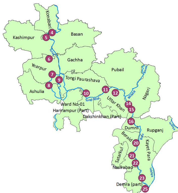
Figure 1: Location of sample sites