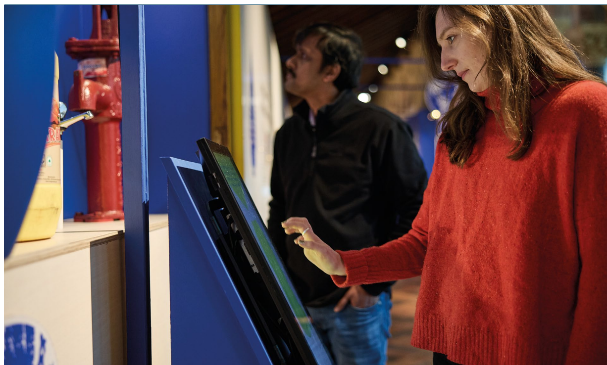
Figure 1: The Fair Water? exhibition takes its visitors on an immersive journey along a river, from source to mouth.

Fair Water? aims to provide a constructive and inspiring approach to how we can maintain and improve our water security. It was designed to leave people feeling excited about the role of research and collaborations to bring about change; informed and concerned about the challenges, including climate change, but not overwhelmed; empowered by possible solutions but not passively hopeful.