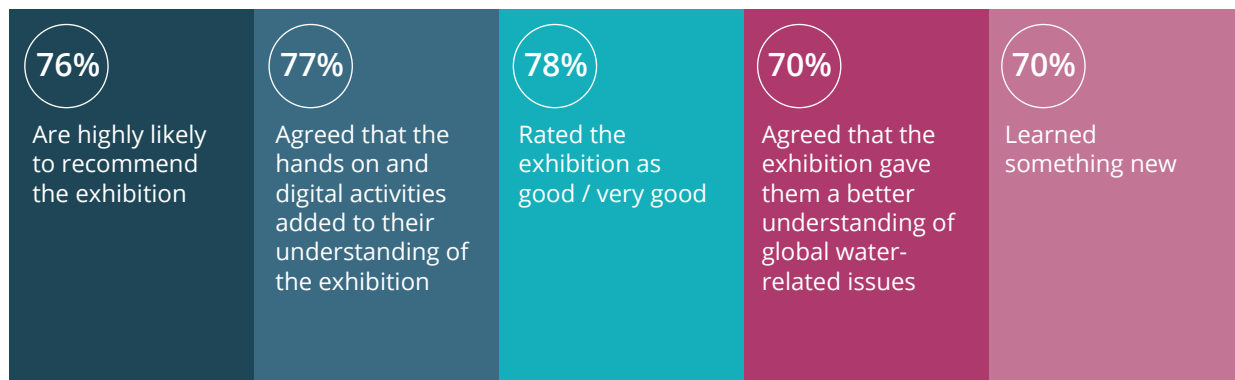
Figure 3: Headline figures from 2,577 visitor surveys at the University of Oxford Museum of Natural History captured between 6 December 2023 and 1 September 2024. The exhibition and accompanying programme of events in 2024 also highlight parallels with water security issues in the UK, using examples of river pollution and proposed dams to encourage visitors to reflect on their own contexts.

A digital interactive installation was designed to explain the water cycle and how it is affected by climate change, whilst video panels allowed visitors to hear directly from researchers and practitioners working on water security issues worldwide. Meanwhile, the exhibition used the museum's collection to create visually engaging displays representing the river ecosystem in Dhaka, Bangladesh and the impact of pollution.