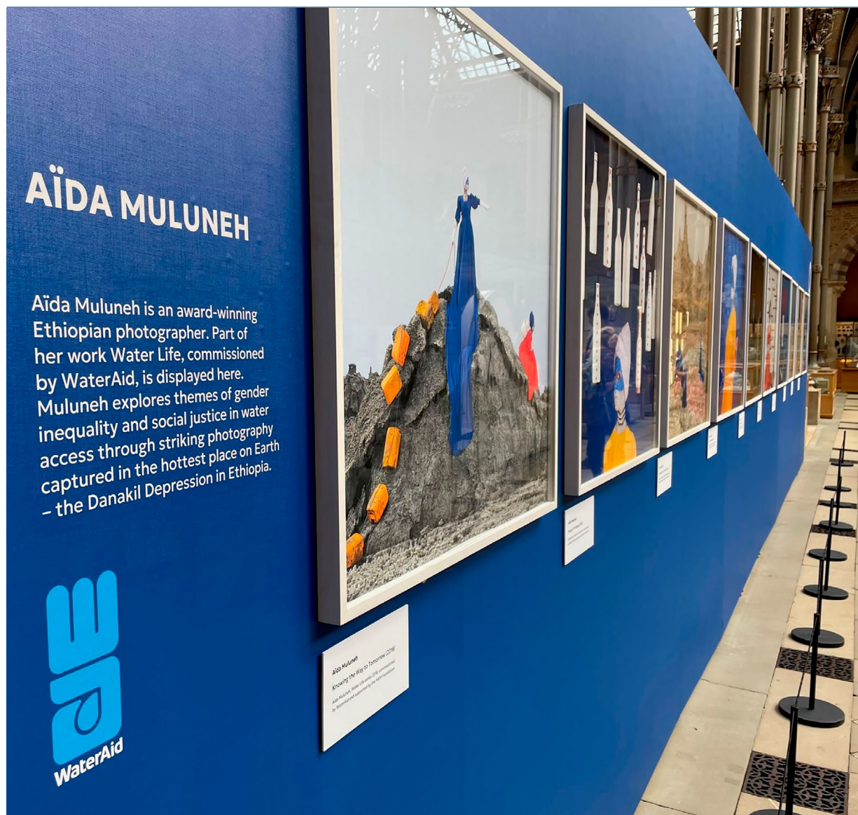
Figure 5: The exhibition also included a striking photographic series by renowned Ethiopian photographer and contemporary artist, Aïda Muluneh – a highlight of the display. Muluneh’s series responds to how living without clean water impacts women’s lives and futures. ©Aida Muluneh, Water life series 2018. Commissioned by Wateraid and supported by the H&M Foundation. More works from the series Water Life (2018) can be seen in the Guardian online gallery