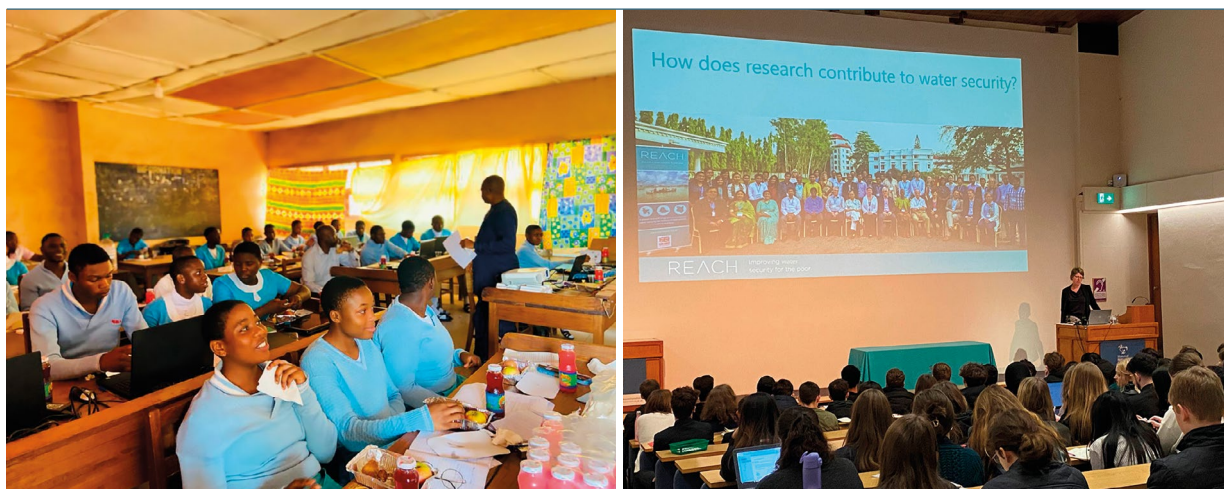
Figure 6: Students from PCSS Mankon in Northwest Cameroon dial in to the Museum of Natural History's lecture theatre for talks on water security